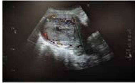
Figure 3: B-ultrasound (May 21 st ).