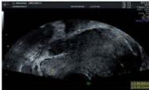
Figure 5: B-ultrasound (Sept. 16 th )