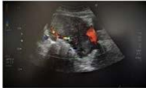
Figure 1: B-ultrasound (April 1st).

up in the outpatient department. During outpatient follow-up, the patient continued to take motherwort herb orally. The placenta was delivered from the vagina on the 8 th day after discharge, and HCG levels gradually returned to normal. After almost two months, no abnormality was found in the B-US examination in the outpatient department (Figure 2).