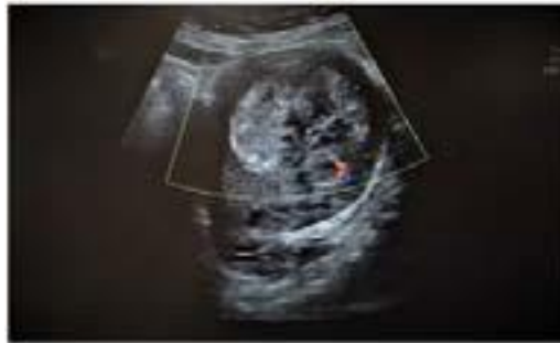
Figure 4: B-ultrasound (July 21 st ).