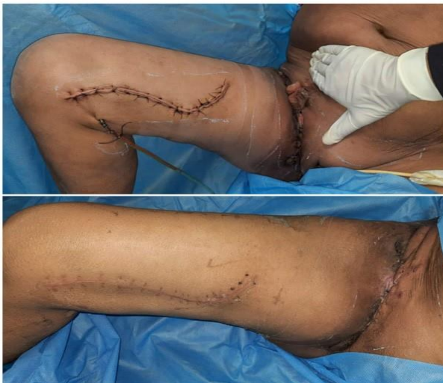
Figure 4: Postoperative pictures with healthy suture line.