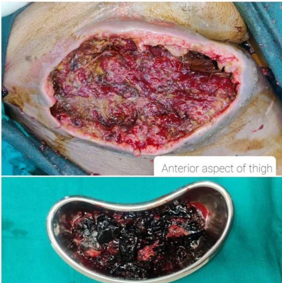
Figure 2: Intra operative wound bed after removal of the hematoma.