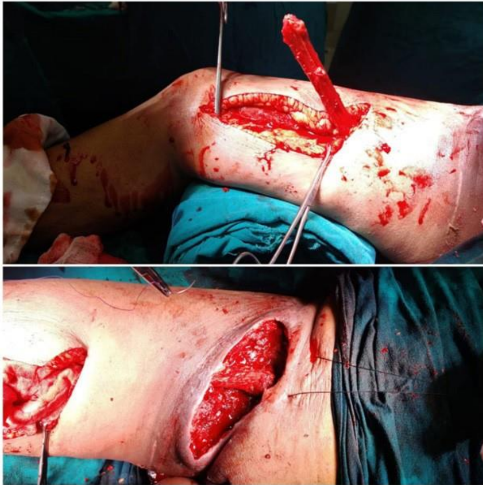
Figure 3: Gracilis flap elevation and using it to give cover to the vessels to prevent further complications; seen here in the second image the healthy wound bed post debridement and gracilis muscle flap in the right groin.